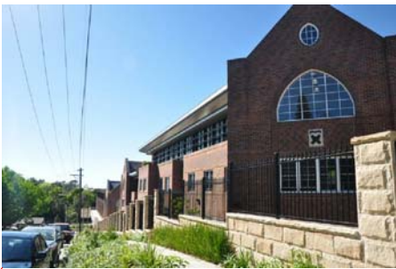
Boarding House (NW view) Max. Height: 12.49m (at corner) Parapet RL: 206.63 Kerb RL: 194.14