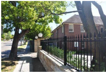
MacNeil House (SW view) Max. Height: 9.51m Ridge RL: 203.44 Kerb RL: 193.93