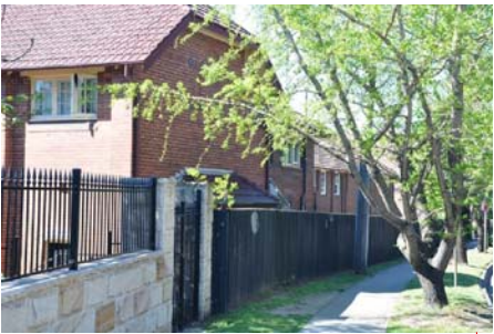
Gillespie House (NW view) Max. Height: 8.42m Ridge RL: 202.99 Kerb RL: 194.57