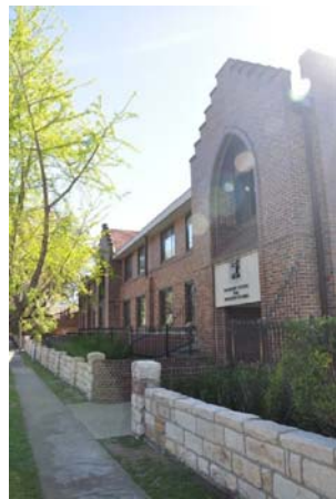
Patterson Centre (SW view) Max. Height: 10.53m Parapet RL: 203.25 Kerb RL: 192.72