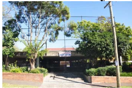
Carpark & Tennis Courts (E view) Max. Height: 4.3m (not including fence) Slab RL: 190.90 Kerb RL: 186.77