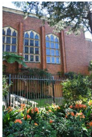
Chapel (S view) Max. Height: 18.37m Parapet RL: 209.19 Kerb RL: 190.82