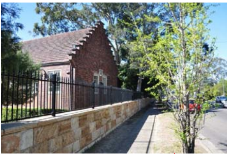
Arts Building (NW view) Max. Height: 10m Parapet RL: 202.76 Kerb RL: 192.76