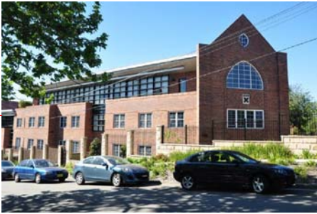
Boarding House (N view) Max. Height: 13.56m (along facade) Eaves RL: 203.16 Kerb RL: 189.6