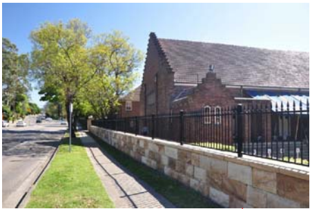
Memorial Hall (SW view) Max. Height: 12.68m Parapet RL: 205.70 Kerb RL: 193.02