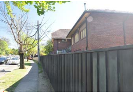
Gillespie House (SW view)