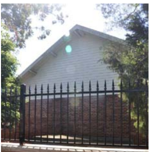
Drama/ Gym (W view) Max. Height: 8.74m Ridge RL: 201.19 Kerb RL: 192.45