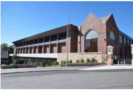
Great Hall & Swim Centre (NW view) Max Height: 14.15m Parapet RL: 200.05 Footpath Paving RL: 185.90

NOTES: -Heights shown represent highest points surveyed (typically parapets or roof ridges, unless otherwise indicated) -TOK (Top Of Kerb) levels are the nearest levels to heights available on survey. -All survey information taken from Garvin Morgan Surveys, dated 29-09-2011. -PROPOSED BUILDING HEIGHTS: Please refer to Elevation drawings.